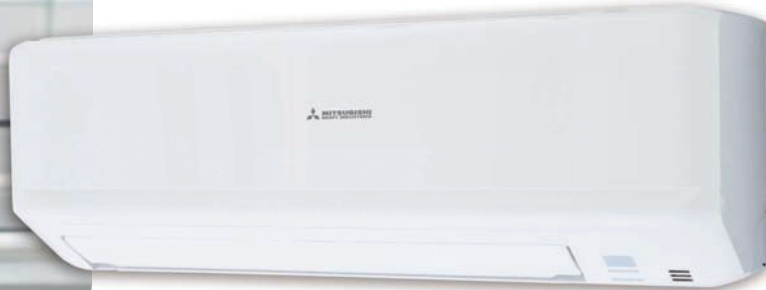
SRK25ZSP-W, SRK35ZSP-W, SRK45ZSP-W